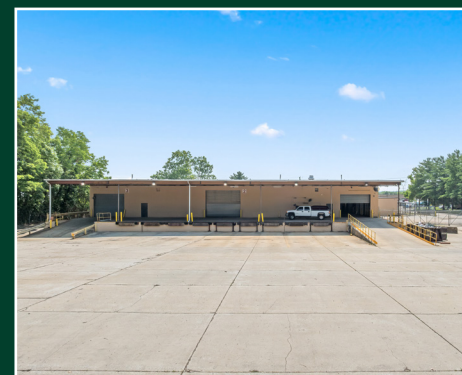
9 DOCKS + 2 RAMPED DRIVE INS